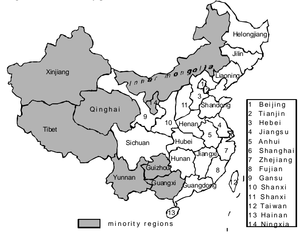
Figure 1 main minority provinces and autonomous regions in middle and west China