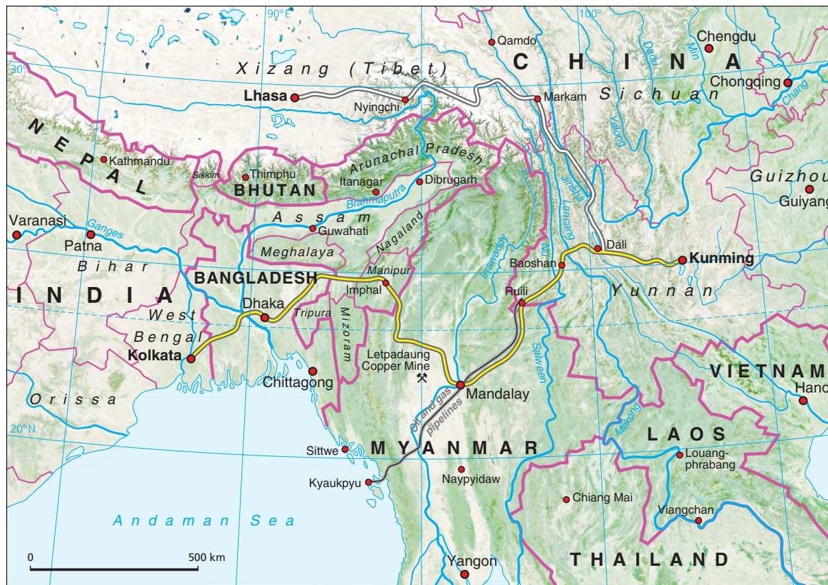
Figure 1: Borderlands between Northeast India, Bangladesh, Myanmar and Southwest China and planned road connection Kolkata (West Bengal)–Kunming (Yunnan)

Source: THE HINDU, 14. 3. 2012, unter www.thehindu.com/news/international/chinese-lawmakers-propose-all-weather-border-highway/article2992000.ece (Accessed on March 10, 2013).