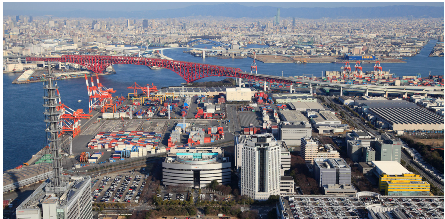
The majority of Osaka Bay area is built on reclaimed land

Director of Urban Research Plaza, Osaka City University Kwansei Gakuin University Setsunan University Ryukoku University Deputy Mayor of Sakai City Saitama University Vice President of Osaka City University Osaka City University Fukuoka University Chief Administrative Officer, Osaka City University Kwansei Gakuin University Mayor of Minato Ward, Osaka City Mayor of Kita Ward, Osaka City Former Director of Port & Harbor Bureau, Osaka City Ryukoku University