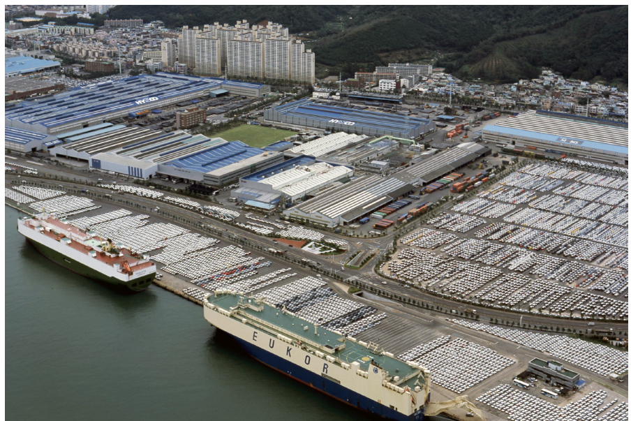
The Hyundai Motor factory in Ulsan is the largest in the world

Fulbright University Vietnam University of Ulsan Yeungnam University Dean of the School of Social Sciences, University of Ulsan University of Ulsan University of Ulsan Busan IT Promotion Agency University of Ulsan Ulsan Development Institute Hanbat National University Ulsan Development Institute President of University of Ulsan Hannam University Mayor of Ulsan Metropolitan City University of Ulsan